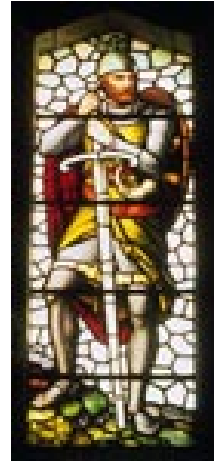
William Wallace – Stained glass window in Dunfermline Abbey Kirk

The news did so surprise the ancient knight, He almost fainted in his nephew's sight: Then bids keep the secret: "For such fishing sport, If it be known, you might pay dearly for't." "Uncle," said Wallace to the good old man, "I'll push my fortune now where best I can, Since I no longer may with you abide. I'll try these English geldings how they ride." A purse of gold the knight unto him gave. Wallace kneel'd down, and humbly took his leave. "When that is done, pray nephew send for more."