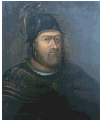
Portrait of Sir William Wallace

William Wallace has come down in history as “the hammer of the English.” After interminable skirmishes with English soldiers occupying Scotland, he commanded the Scottish troops along with Andrew Morey in 1297 at the Battle of Stirling Bridge. Following this unexpected but resounding victory against the English, Wallace was knighted and named Guardian of Scotland. The 700th anniversary of the Battle of Stirling Bridge was celebrated in 1997 with many com-