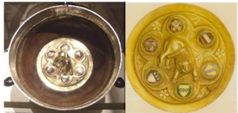
The Bannetyne or Bute Mazer. From left to right - original and copy

The Bute (or Bannetyne) Mazer (quach), commissioned in 1319, currently on display in the Scottish National Museum, commemorates the contributions of the Auchinames Crawford along with five other noble families to the Battle of Bannockburn.